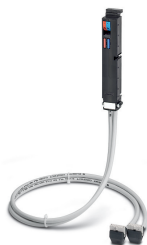
VIP VARIOFACE front adapter, with connected system cables for SMATIC S7-300, 2 x 8 channels can be connected, cable length: 1.5 m

Please be informed that the data shown in this PDF Document is generated from our Online Catalog. Please find the complete data in the user's documentation. Our General Terms of Use for Downloads are valid ( http://phoenixcontact.com/download )