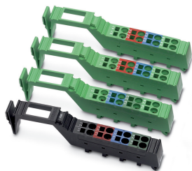
Connector set, for Inline bus coupler with I/Os mounted in rows

Please be informed that the data shown in this PDF Document is generated from our Online Catalog. Please find the complete data in the user's documentation. Our General Terms of Use for Downloads are valid ( http://phoenixcontact.com/download )