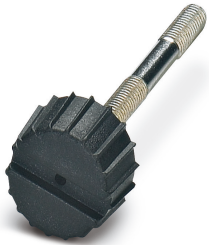
Fillister head screw with plastic knurl, M3 x 40

Please be informed that the data shown in this PDF Document is generated from our Online Catalog. Please find the complete data in the user's documentation. Our General Terms of Use for Downloads are valid ( http://phoenixcontact.com/download )