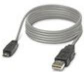
Connecting cable, for connecting the controller to a PC for PC Worx and LOGIC+, USB A to micro USB B, 2 m in length.

Connecting cable - CAB-USB A/MICRO USB B/2,0M - 2701626