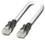
Patch cable, CAT5, assembled, 1 m

Patch cable - FL CAT5 PATCH 1,0 - 2832276