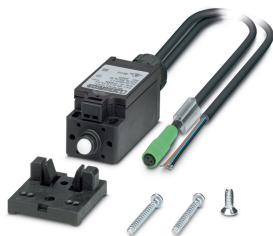
Door position switch with 3 m cable with open cable end and 0.6 m cable with M8 socket (Snap-in), including mounting accessories

Please be informed that the data shown in this PDF Document is generated from our Online Catalog. Please find the complete data in the user's documentation. Our General Terms of Use for Downloads are valid ( http://phoenixcontact.com/download )