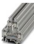
Double-level terminal block, with preassembled resistors

Component terminal block - UKK 5-2R/NAMUR - 2941662