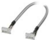
Round cable set; connection 1: IDC/FLK socket strip (1x 14-position); connection 2: IDC/FLK socket strip (1x 14-position); cable length: 2 m

Cable - FLK 14/EZ-DR/ 200/KONFEK - 2288930